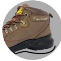
SHOCK ABSORBENT & ENERGY ABSORBING HEELS