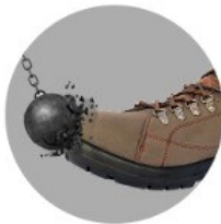
ANTI-IMPACT STEEL TOE CAP