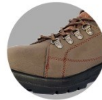
ACTION NUBUCK LEATHER